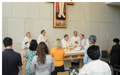
▲ Liturgical and Spiritual Events