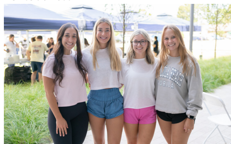
▲ Welcome Week