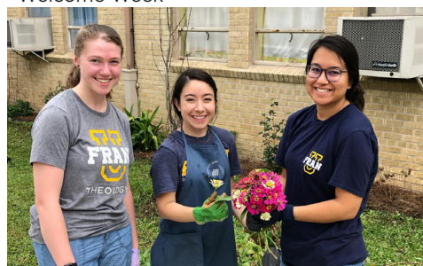
▲ Service in the Community