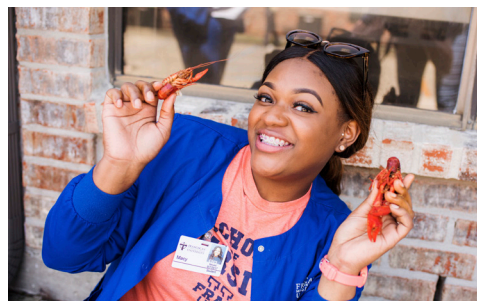
▲ Annual Crawfish Boil

As a Catholic, Franciscan university, we are proud to offer opportunities for students of all faiths to engage in their relationship with Jesus Christ. We do this through social events, celebrating the liturgy, spiritual development offerings, participating in the Diocese of Baton Rouge Young Adult events, and more!