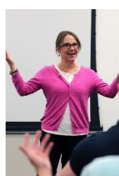
No distance shots