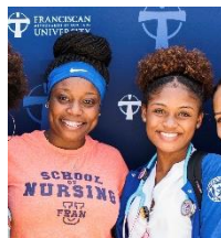
No group shots