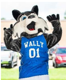
No funny faces or body positions