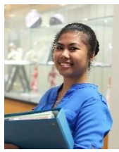
No angle shots