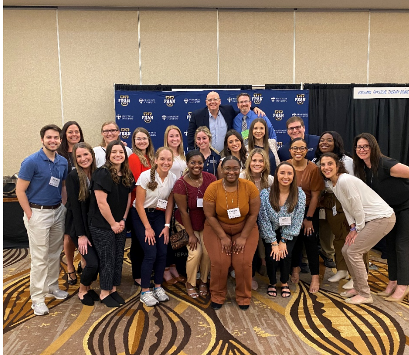
Over 20 faculty and students representing all 3 cohorts attended APTA-LA Spring 2022