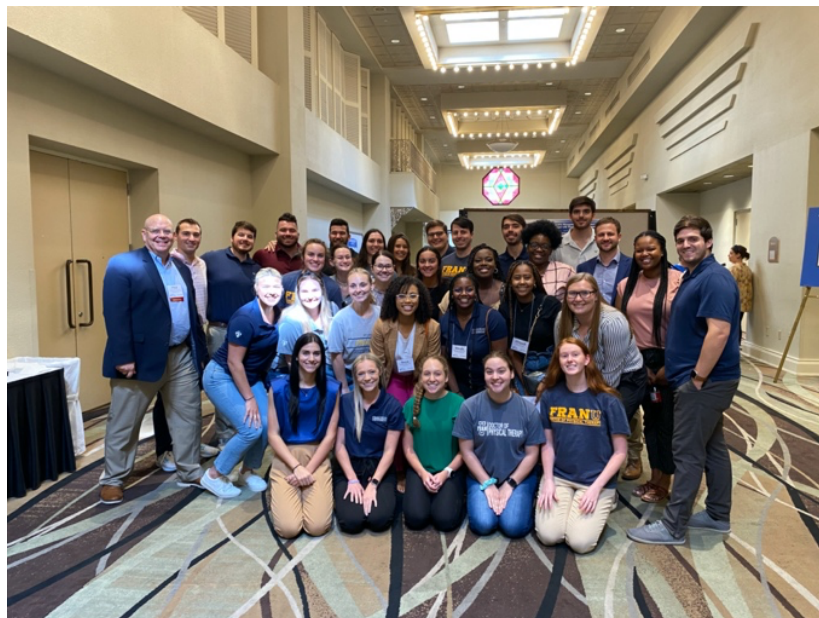
FranU students, faculty and alumni attended the annual APTA-Louisiana Research Symposium in Baton Rouge.