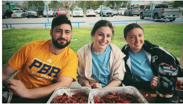
2 - First year students enjoy crawfish after DPT Olympics.