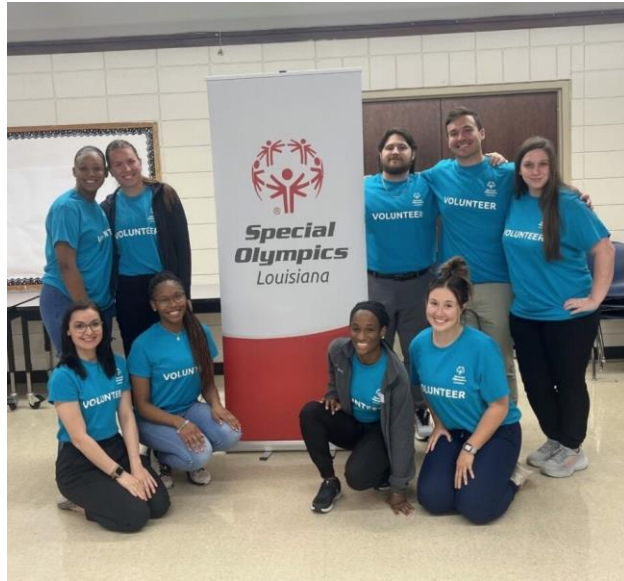
8 - 1st year students volunteering at MedFest, hosted by Special Olympics Louisiana.

First year DPT students from FranU attended MedFest, hosted by Special Olympics Louisiana on Friday, February 23rd. As part of their service learning, these students collaborated with healthcare providers to conduct medical screenings for middle and high school students with intellectual disabilities. Special Olympics Louisiana provides these students with opportunities to demonstrate their abilities in various sports activities while also promoting their health and well-being.